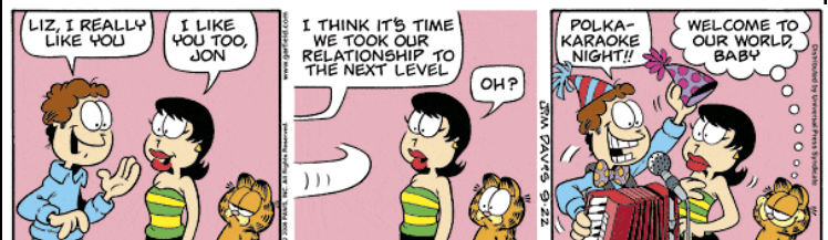
Garfield: Jim Davis

Upcoming activities: club elections February 2011; possible performance at Victoria Seniors Exposition in March 2011.